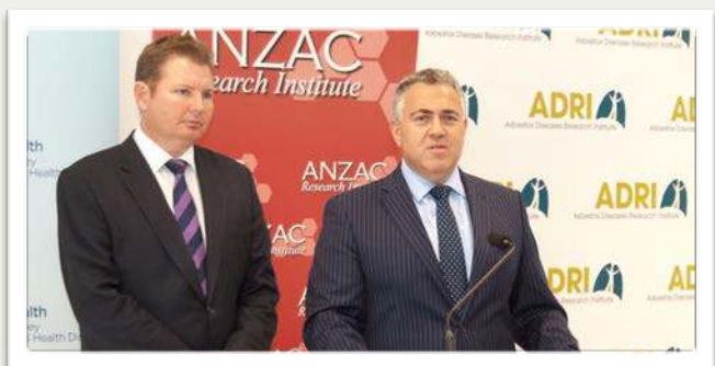
[Above] Mr Craig Laundy, Federal MP for Reid, and the Federal Treasurer, The Hon Joe Hockey MP at ADRI.

The Federal Treasurer, The Hon. Joe Hockey MP, accompanied by Mr Craig Laundy, Federal MP for Reid, visited Concord Hospital's medical research institutes on the 10 th June 2014.